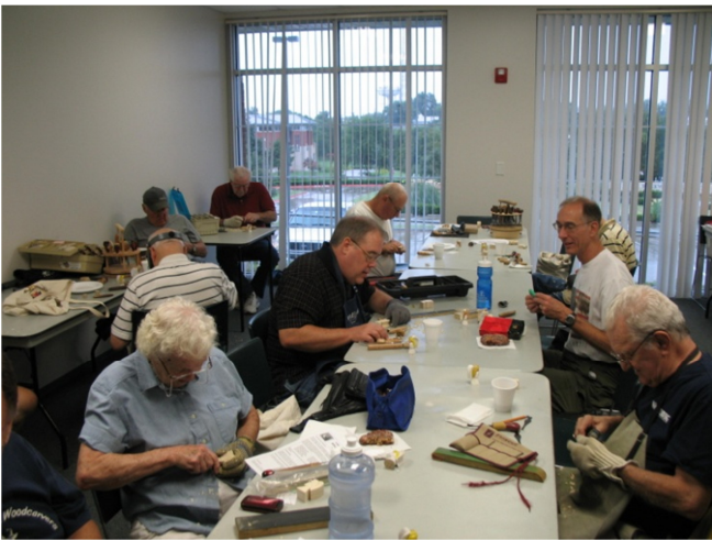
Lots of concentration going on here.