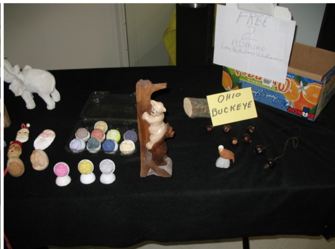
September Display Table