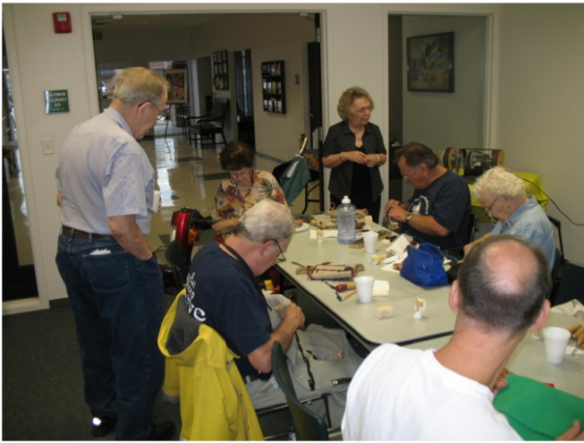
Dean's teaching but what's that shiny spot in the foreground?