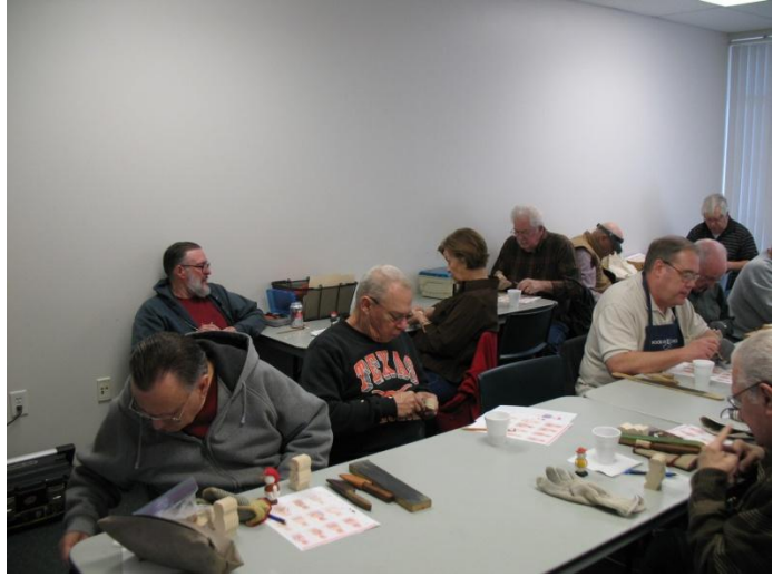
Great turnout to a new carving year.