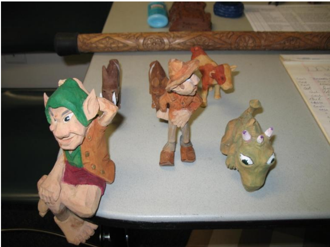
More Show and Tell. Charlie's been busy.