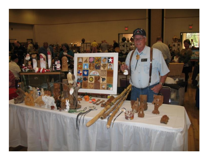
The Club table and illustrius President