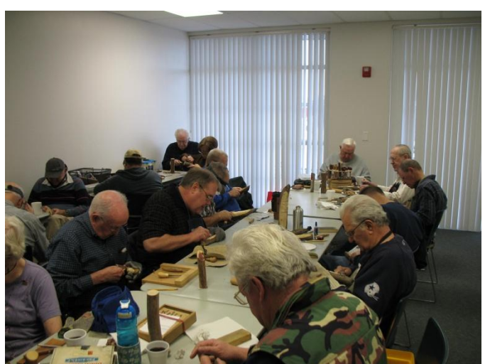
What a good looking group of carvers