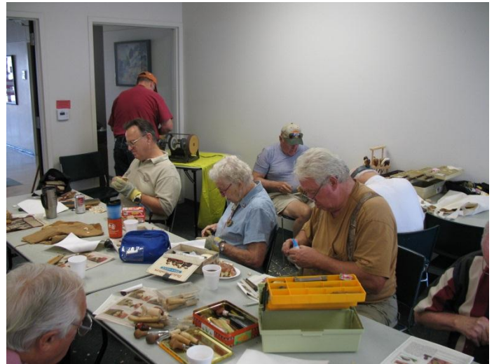
WE MIGHT NOT KNOW WHAT RAIN LOOKS LIKE ANYMORE, BUT WE'LL ALL HAVE ARKS IF IT COMES