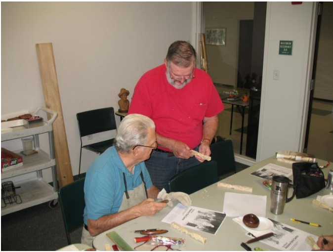
You put tab "A" into slot "B"