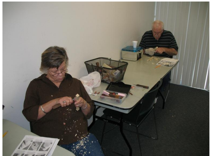
Who decided on this project anyway????