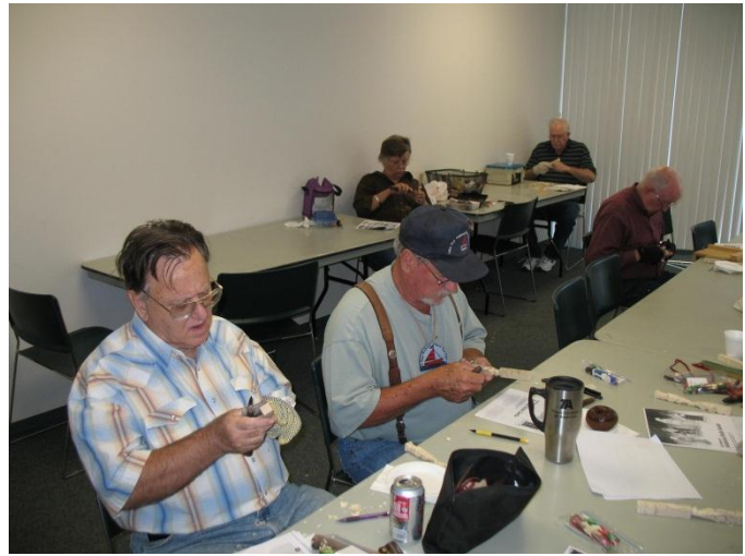
What did you say this was suppose to be?