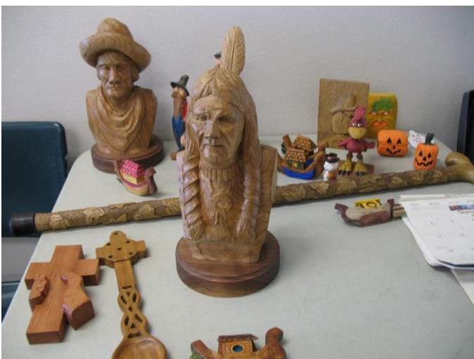
Show and Tell