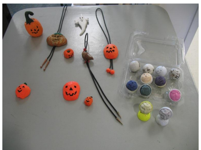
Bernie's ready for Halloween