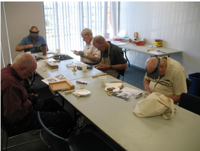
It helps to get close to your work.