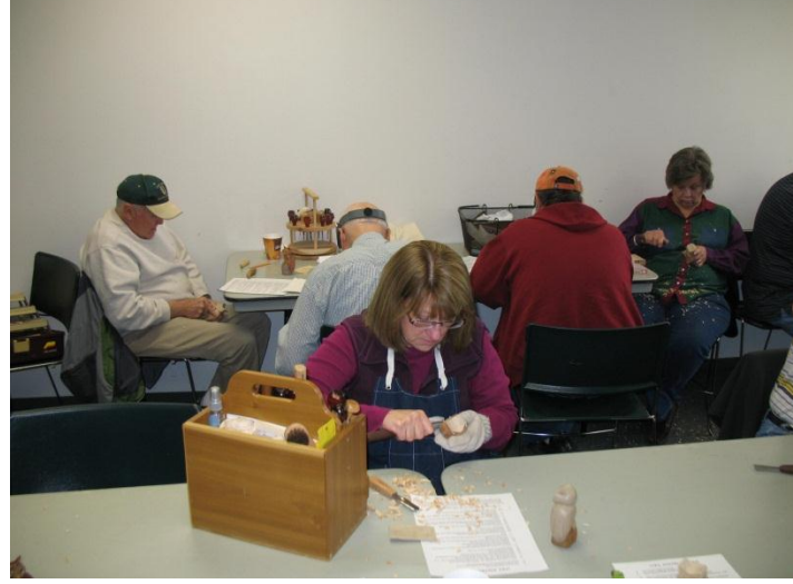
GREAT TURN OUT. Had all except 2 members present.