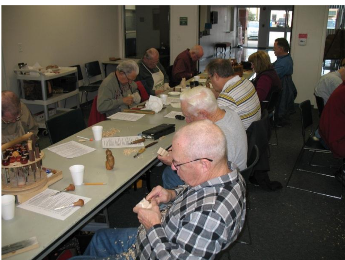
Hard at work. Who would have expected a rock would be that hard to carve?