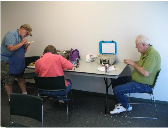
LOOKING FOR THAT ELUSIVE EAGLE