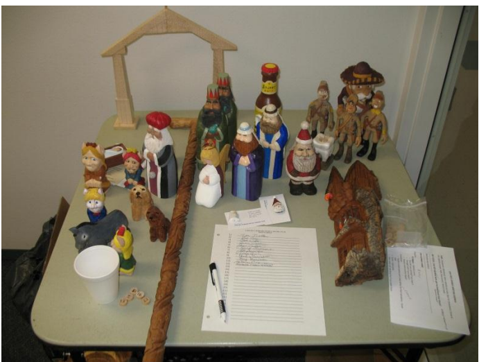
GREAT START ON THE NATIVITY FIGURES