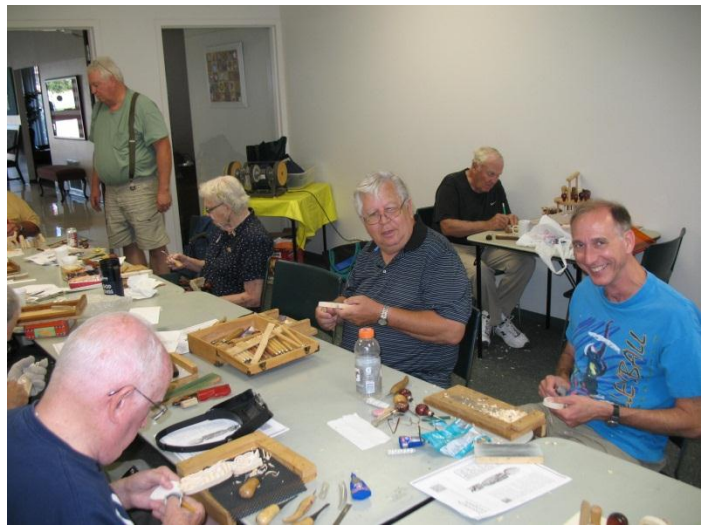
THE CAT (VINCE) THAT ATE THE CANARY? (EAGLE)