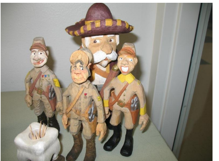
CHARLIE'S TOY SOLDIERS