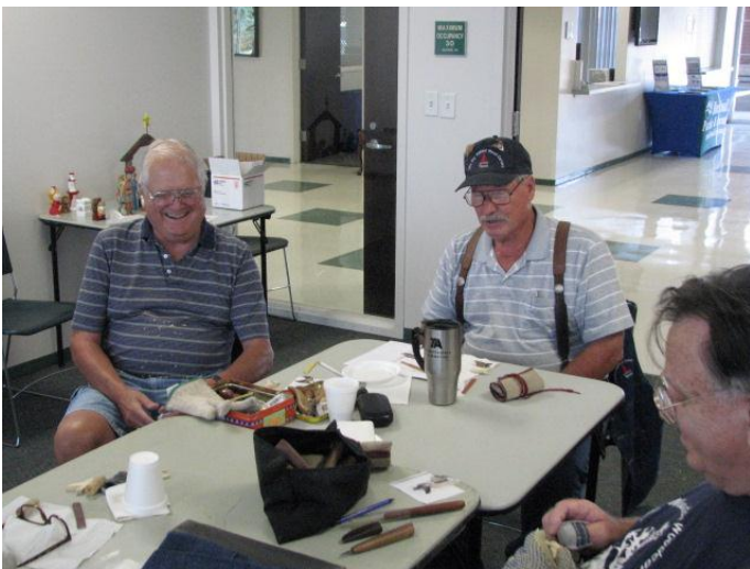
Who says we don't have fun?