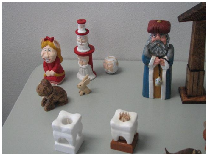
GREAT SHOW AND TELL!!!