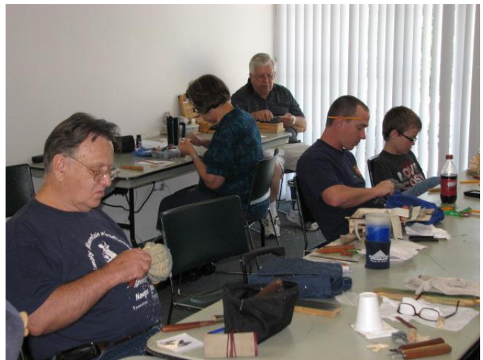
Those guys on the end don't look like Seniors!