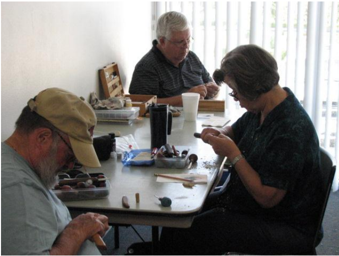
Strange looking duck hunters