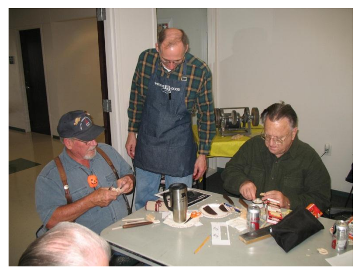
OUR "HEARTLESS" INSTRUCTOR AT WORK