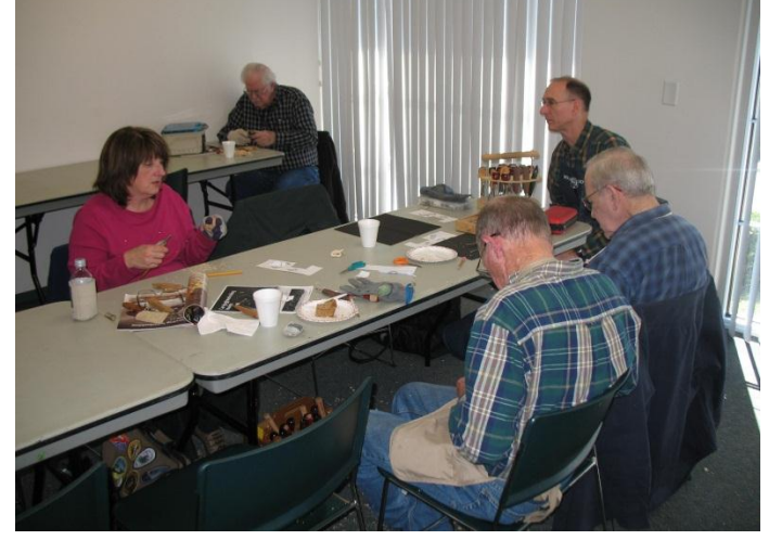
AND MORE OF US GETTING IN TOUCH WITH THEIR SENSITIVE SIDE