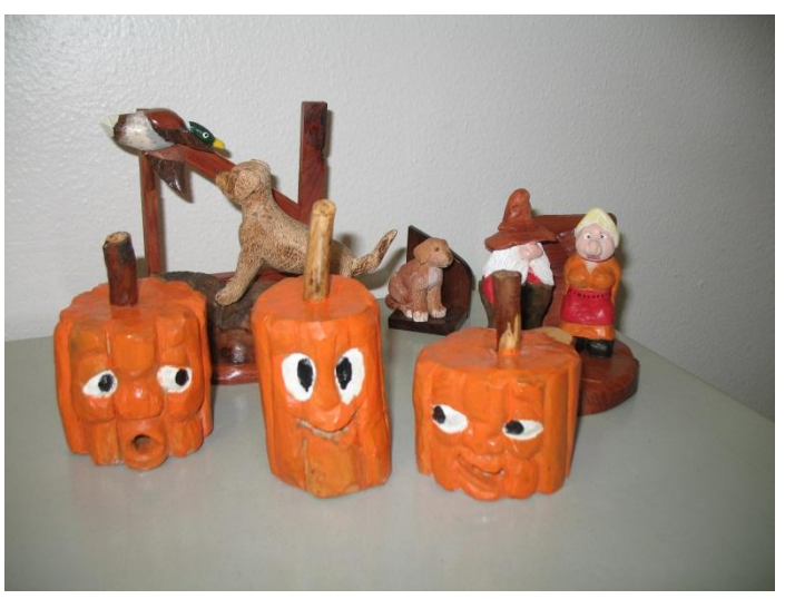
SHOW AND TELL – I'M GUESSING HOLLOWEEN WAS CLOSE