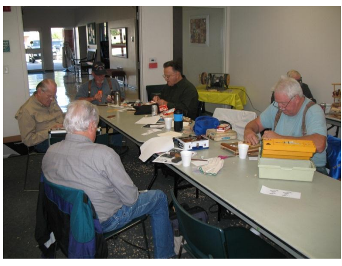
WORKING ON THE HEART CHAIN