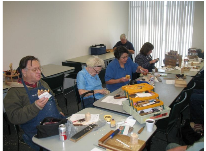
The hardest part for the instructor was getting the members to carve instead of eat!!