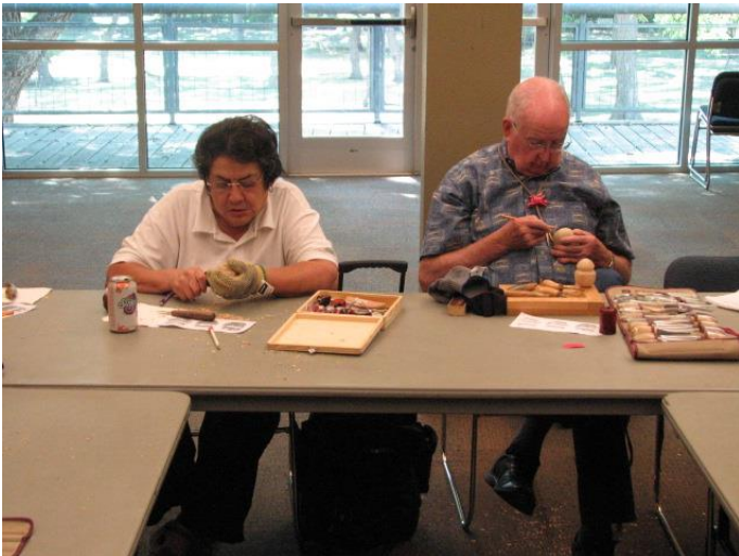
There's a dog in that egg?