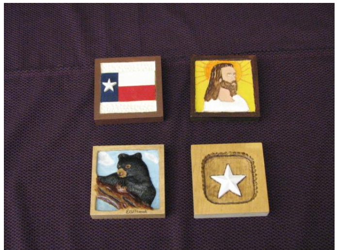
SHOW AND TELL (Don't forget to bring your quilt squares if you haven't already!!!)