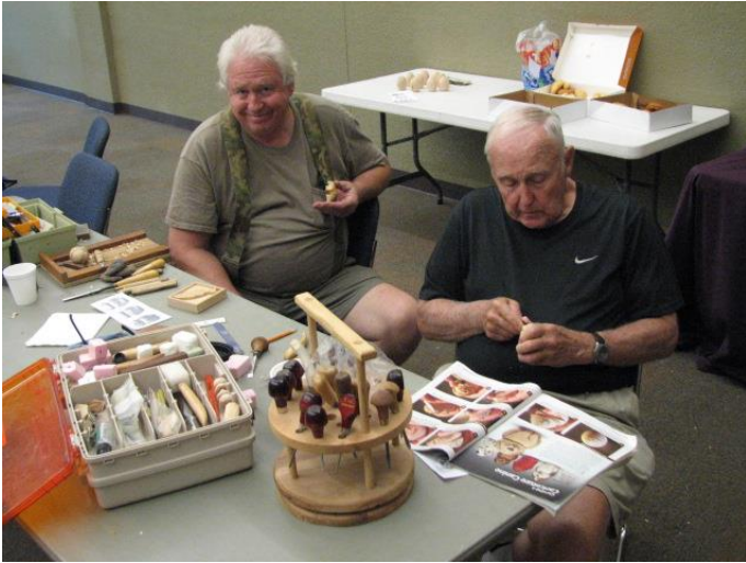
Just happy to be here.