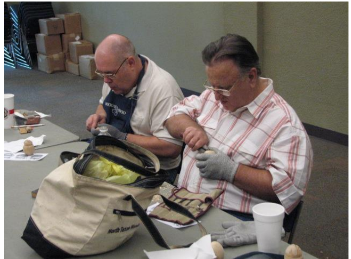
Looking for that elusive puppy.