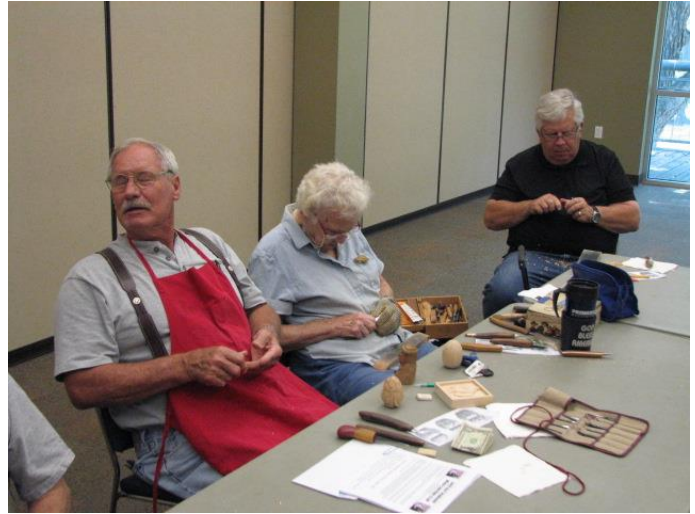
How to carve without a knife and your eyes closed