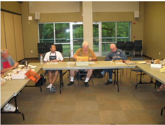
It was hot but that didn't stop us from having fun