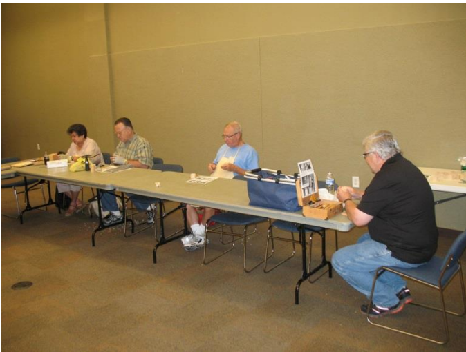
More Christmas ornaments in the making