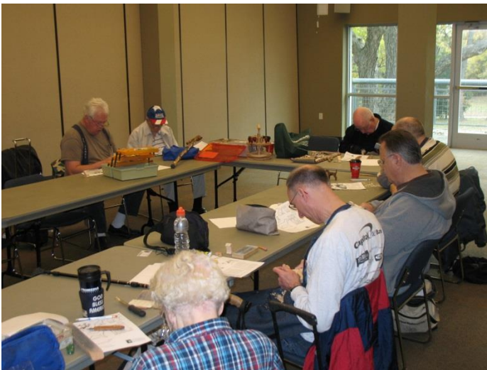
THE REST OF THE GROUP