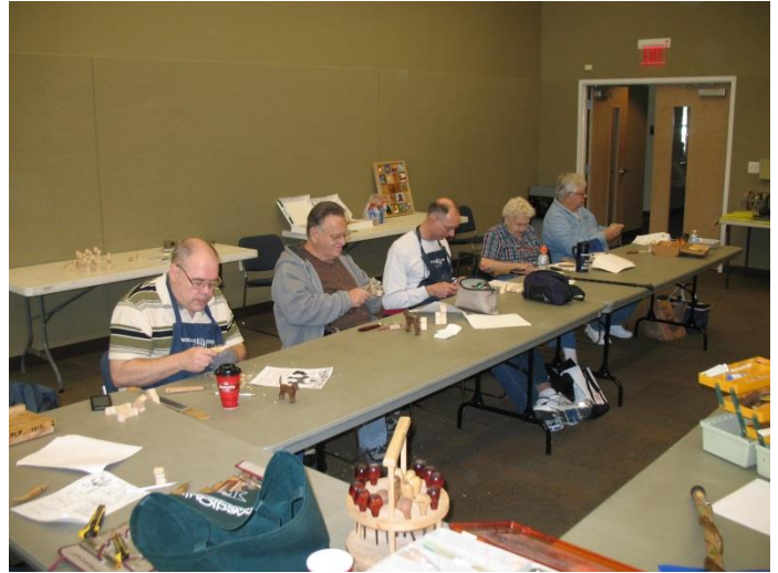
SMALL GROUP THIS MONTH